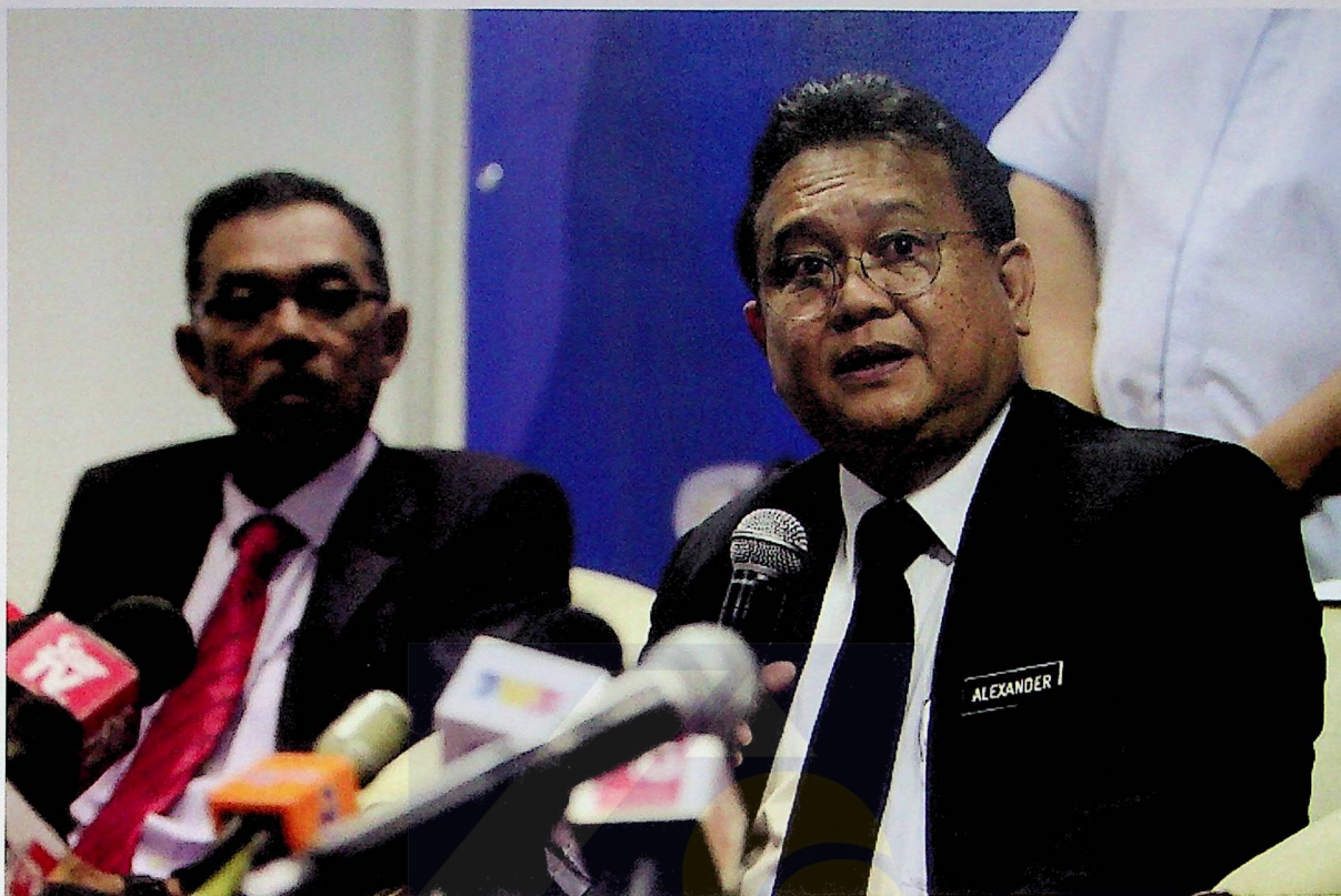
Domestic Trade and Consumer Affairs Minister Datuk Alexander Nanta Linggi (right) speaks during a press conference in Putrajaya March 17, 2020.

Nanta was asked to comment on panic buying undertaken by the public since yesterday (March 16).