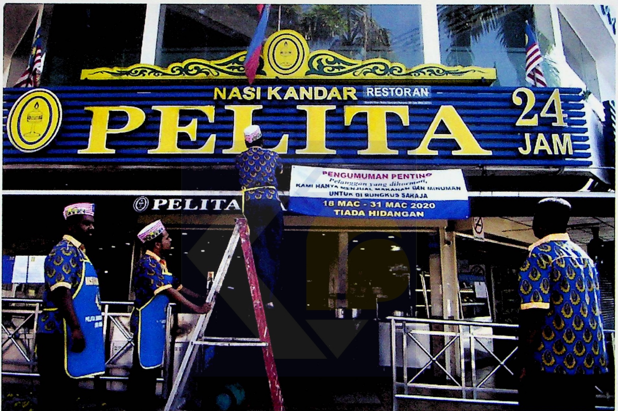
A Pelita Nasi Kandar worker hangs up a sign detailing the dine-in restriction in Bangsar March 18, 2020.

Wednesday, 18 Mar 2020 12:39 PM MYT BY IDA LIM