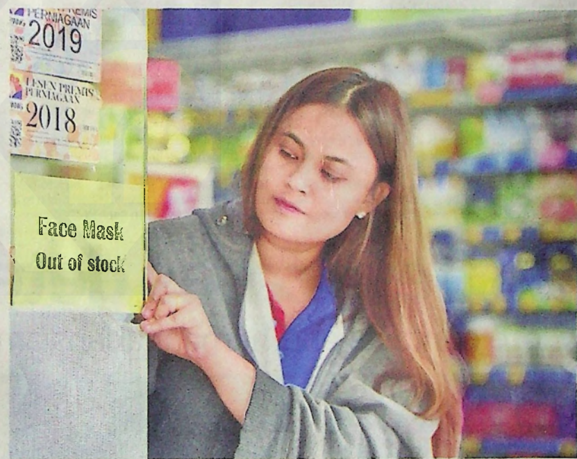
In high demand: A pharmacy worker in Meranti Jaya, Puchong, putting up a sign saying the outlet has run out of face masks.

Face masks are controlled items and are sold at 80 sen per piece for a three-ply mask while the N95 mask is sold at RM6 per unit.