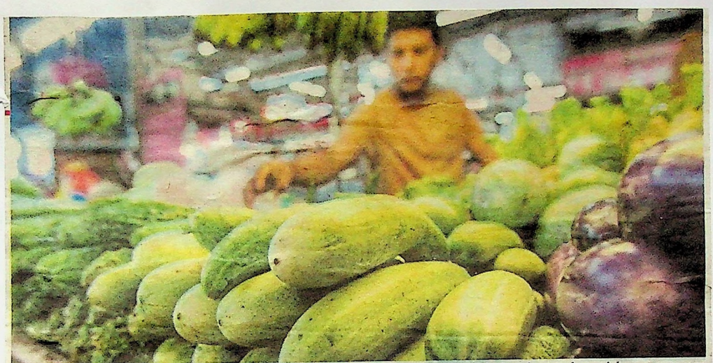
The Malaysia Competition Commission has recently proposed a new wholesale market with e-commerce facilities to reduce dependency on middlemen and avoid extra cost in supplying food.