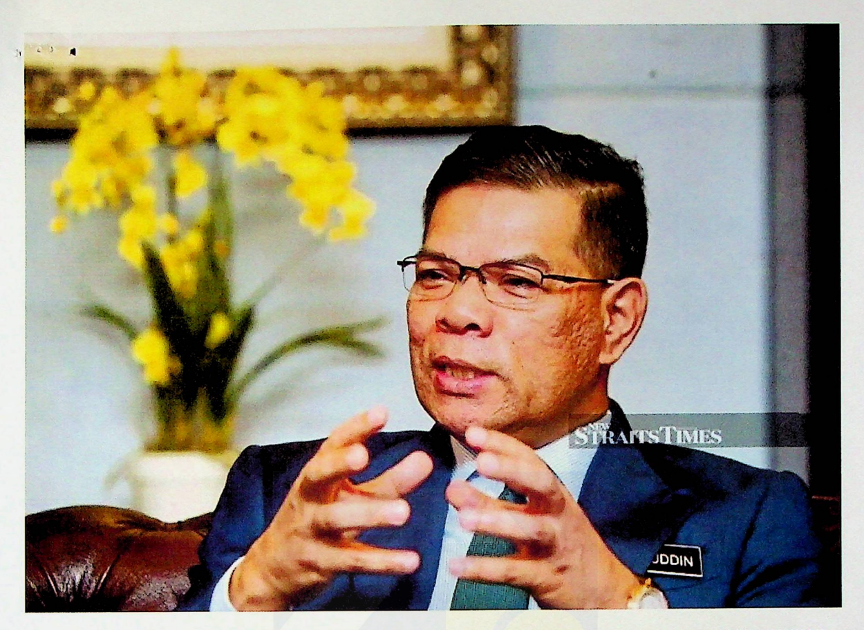
Domestic Trade and Consumer Affairs Minister Datuk Seri Saifuddin Nasution Ismail.