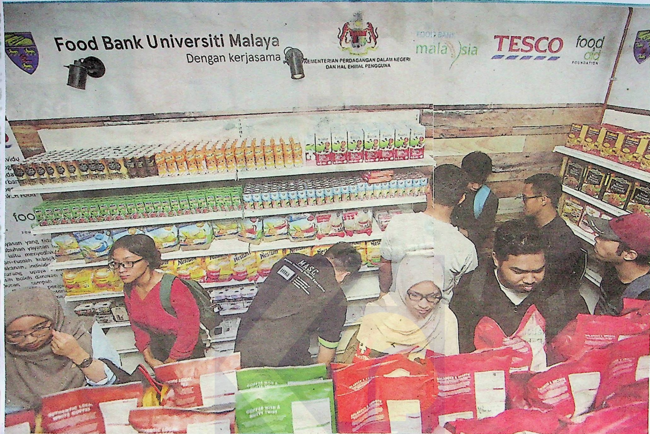
Students selecting food supplies at the Universiti Malaya Food Bank at Perdana Siswa Complex.